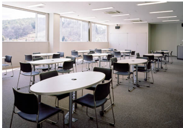
Photo 5. Large meeting room

4 meeting rooms are available. A large meeting room is 150m 2 and 3 small meeting rooms are 20m 2 . A LCD projector, a DVD player, a VCR, a TV and audio equipment are available. Meeting room usage is free of charge.