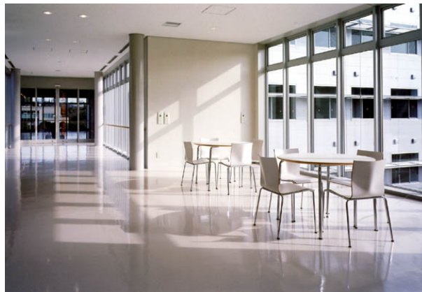
Photo 2. Hallway

ORIC is built in spacious 12,165 m 2 site area. ORIC main building is a three story steel structured building. Total building area is 2,639 m 2 and total floor area is 5,359 m 2 .