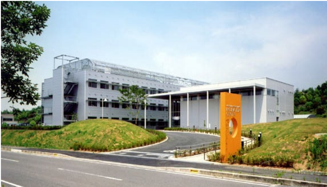
Photo 1. ORIC from the west porch

Okayama Research Park Incubation Center (ORIC), funded by Okayama Prefecture Government (OPG) and launched on April 1 st , 2003, is the first business incubation facilities run in Private Finance Initiative (PFI) scheme in Japan.