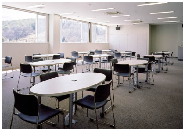
Photo 5. Large meeting room

4 meeting rooms are available. A large meeting room is 150m 2 and 3 small meeting rooms are 20m 2 . A LCD projector, a DVD player, a VCR, a TV and audio equipment are available. Meeting room usage is free of charge.