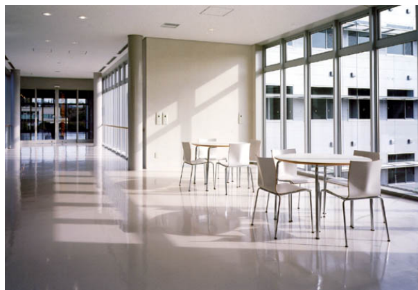
Photo 2. Hallway

ORIC is built in spacious 12,165 m 2 site area. ORIC main building is a three story steel structured building. Total building area is 2,639 m 2 and total floor area is 5,359 m 2 .