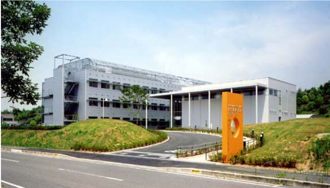
Photo 1. ORIC from the west porch

Okayama Research Park Incubation Center (ORIC), funded by Okayama Prefecture Government (OPG) and launched on April 1 st , 2003, is the first business incubation facilities run in Private Finance Initiative (PFI) scheme in Japan.